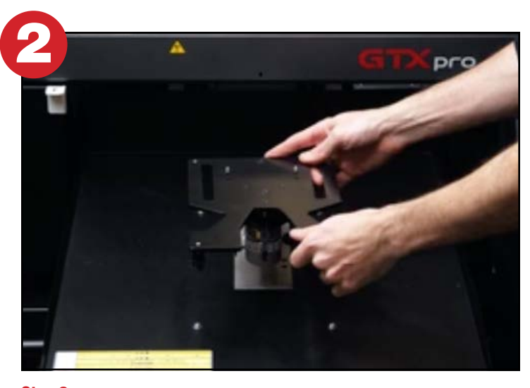
Step 2: Insert the T-Lock Base into the platen stem of the Brother DTG printer.