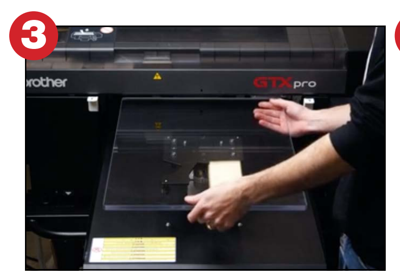
Step 3: Install the T-Lock XL Insert so T-Lock brackets slide into the slots in T-Lock Base.