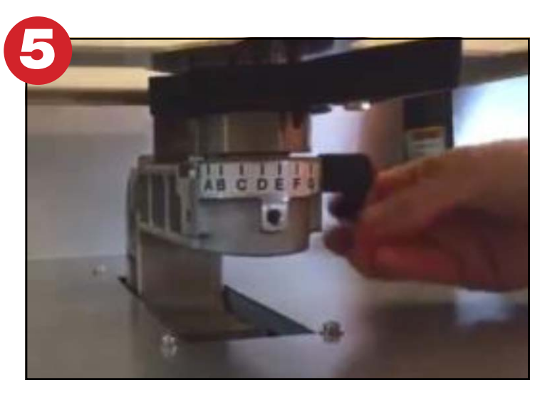
Step 5: Adjust the height of the platen to the desired position and tighten Locking Lever.